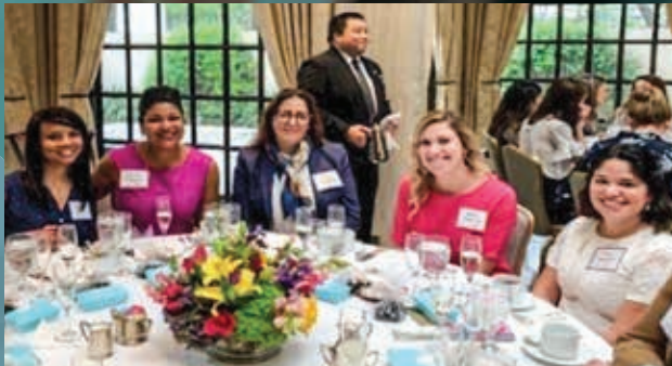
Sixth Annual Afternoon Tea St. Regis Houston