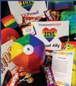
Our Firm Celebrates PRIDE at home with Pride Party Packs