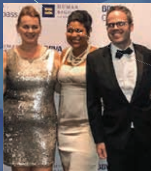
22nd Annual Human Rights Campaign Gala Marriott Marquis, Houston