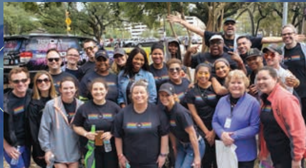
2020 AIDS Walk Houston